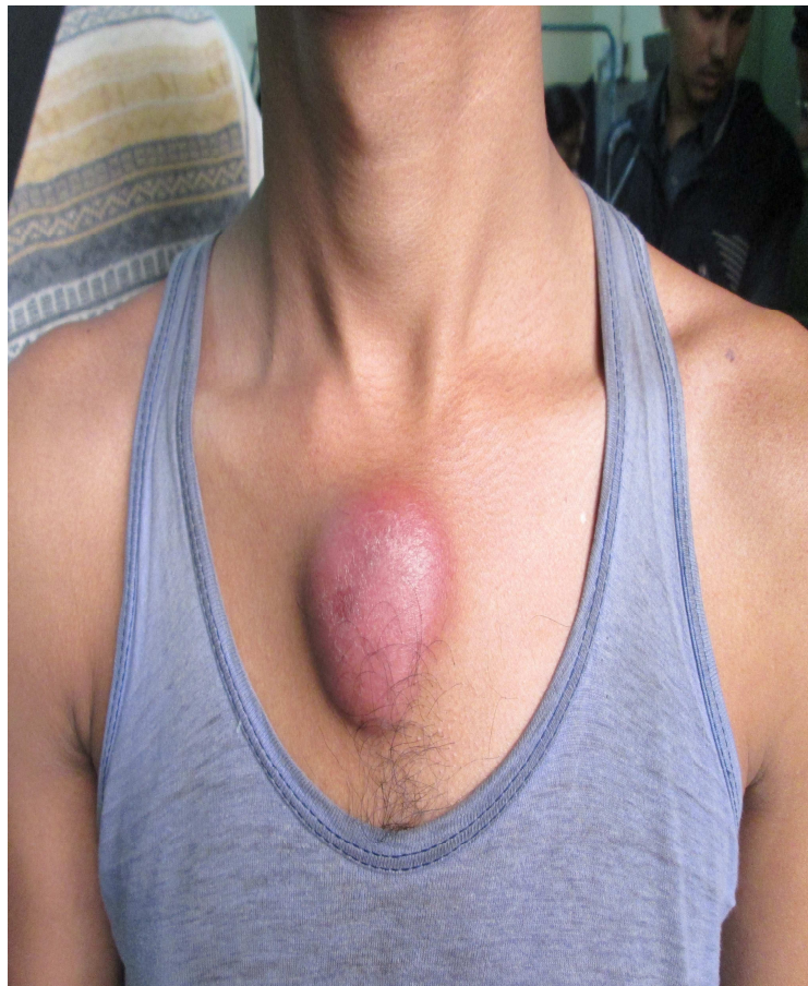
Figure 1: Right sternoclavicular joint swelling.