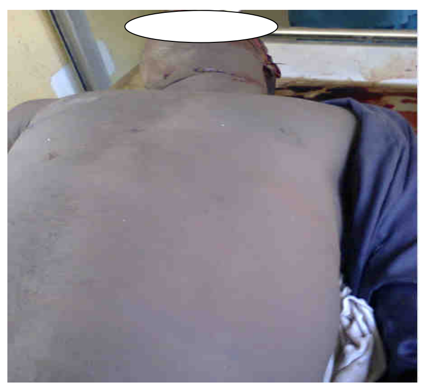
Figure 3 : Showing gross cyanosis of all the body with frothy fluid mixed with frank haemorrhage on the nostrils and mouth.