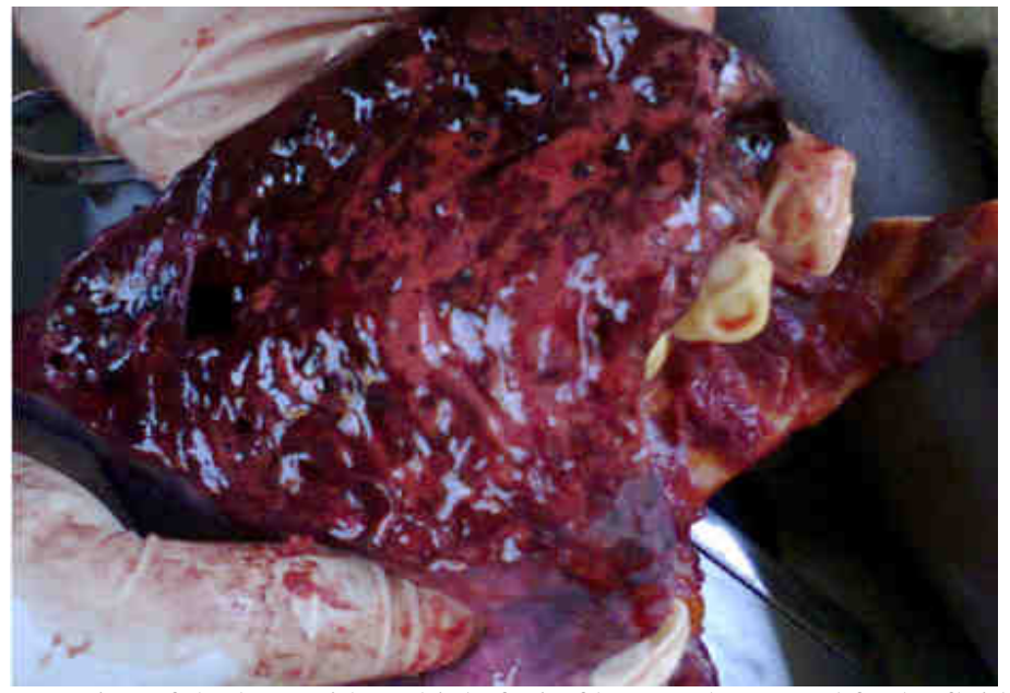
Figure 4: A section of the lung with multiple foci of haemorrhages and frothy fluid of severe glassy shining pulmonary oedema.