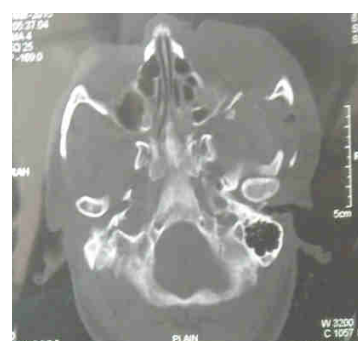
Figure 2: shows preoperative CT scan

Ophthalmology consultation was done and injury to the globe and optic nerve also was ruled out. Inj. T.T 0.5 ml I/M stat and Inj. Ten globe 250 IU I/M stat was administered. Routine antibiotics and analgesics were administered and the patient was transferred