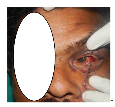
Figure 8 showing eyeball movement to right