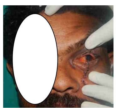
Figure 9 showing eyeball movement to left