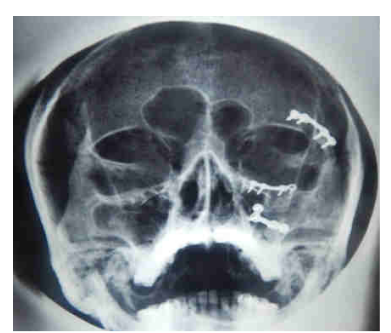
Figure 12 showing postoperative x-ray