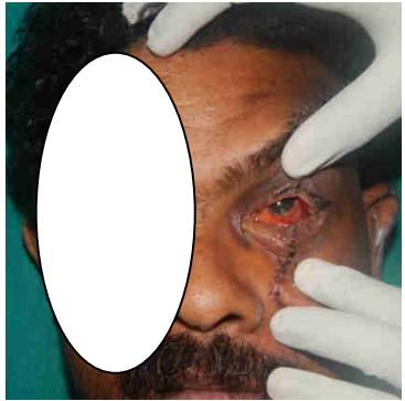
Figure 10 showing eyeball movement in an upward direction.