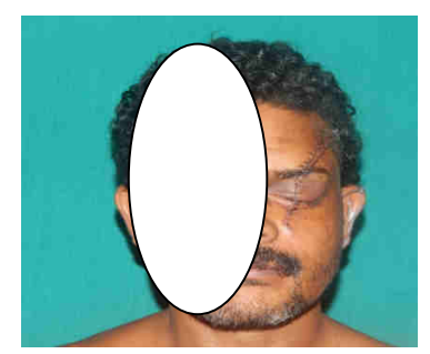
Figure 7 showing persistent ptosis

"Assault injury to the face with an axe- A rare case report."