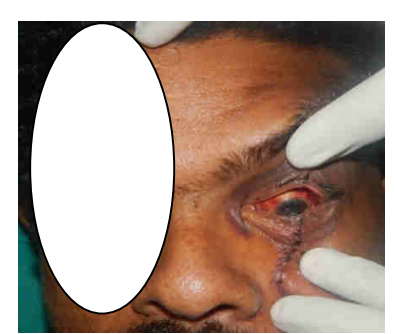
Figure 11 showing eyeball movement in a downward direction. Postoperative x-ray – paranasal sinus view was taken to evaluate the reduction (figure 12).

"Assault injury to the face with an axe- A rare case report."