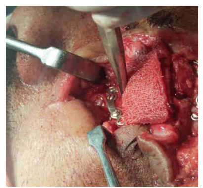
Figure 5 shows infraorbital wall exposed and fixed with 2mm four hole orbital plate and 2*6 screws

The zygomatic buttress was exposed by intraoral incision and the fracture segments stabilized with 2mm L-shaped four hole plate and 2*6 mm screws. The intra-oral wound was then closed with 3-0 vinyl. Lateral canthotomy was done followed by