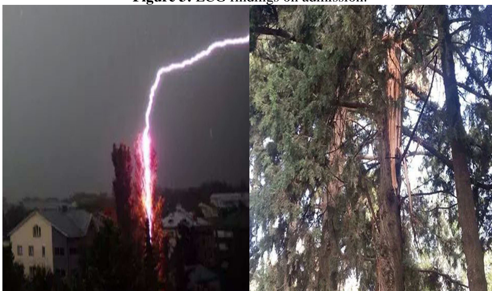
Figure 1a-1b: Appearance of the moment of lightning and the destruction on the tree.