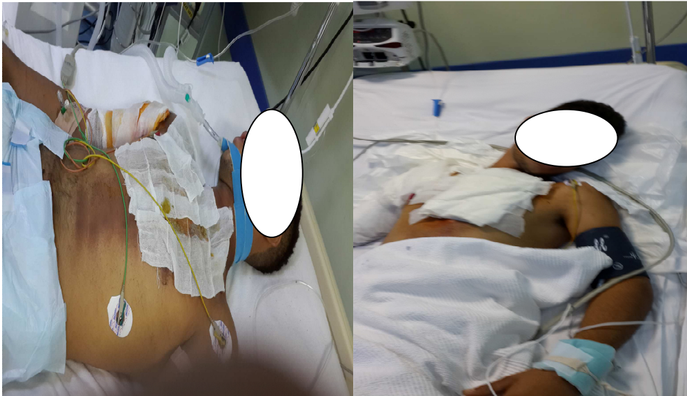
Figure 2a-2b: General appearance of the patient on day 1 and 4 of ICU hospitalization.