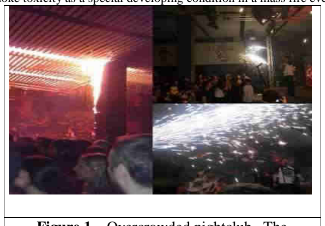
Downloaded from <u>Medico Research Chronicles</u> "Smoke toxicity as a special developing condition in a mass fire event."

Figure 1 – Overcrowded nightclub. The moment of fire initiation