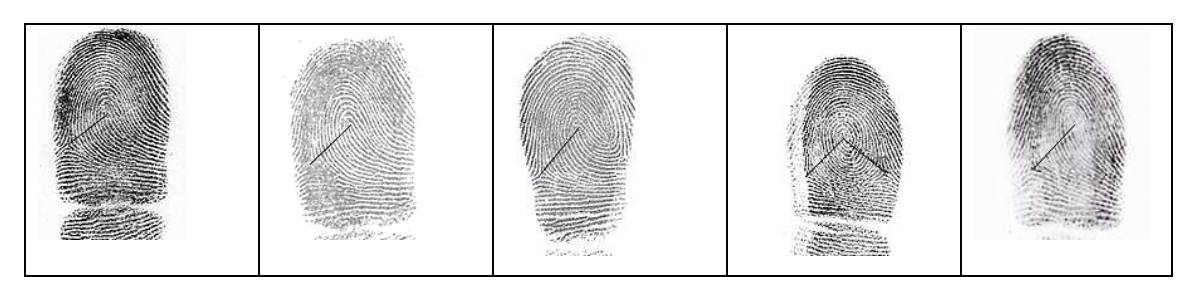
Fig 2: Dermatoglyphic print of fingertips of Infertile male.