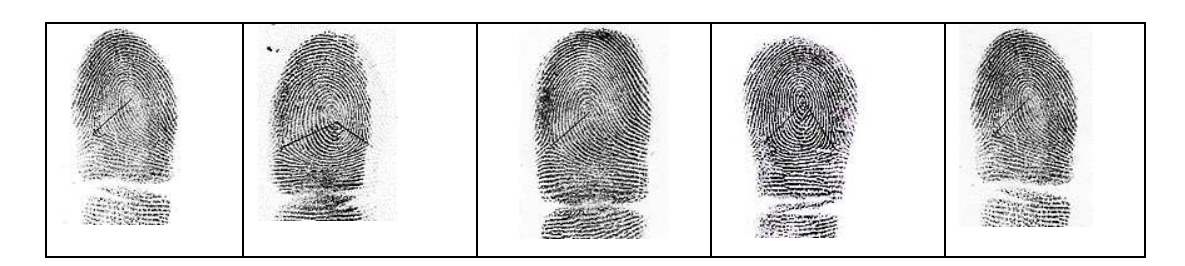
Fig 1: Dermatoglyphic print of fingertips of Control male.

The prints were collected by standard ink method (12). The hand was impregnated with ink and pressed on paper. Digital patterns were classified into loops, whorls and arches. Finger ridge counting was done using a hand lens. The angles atd, dat and adt were observed using a magnifying glass. Finding of both hands of cases and controls was compared. Statistical analysis of the data was done using 't'test and chi square test. Data was compiled and analyzed in the Department of Anatomy, AIIMS Patna.