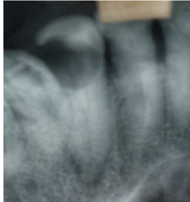
Figure 4: Two distinct root canal apices are seen