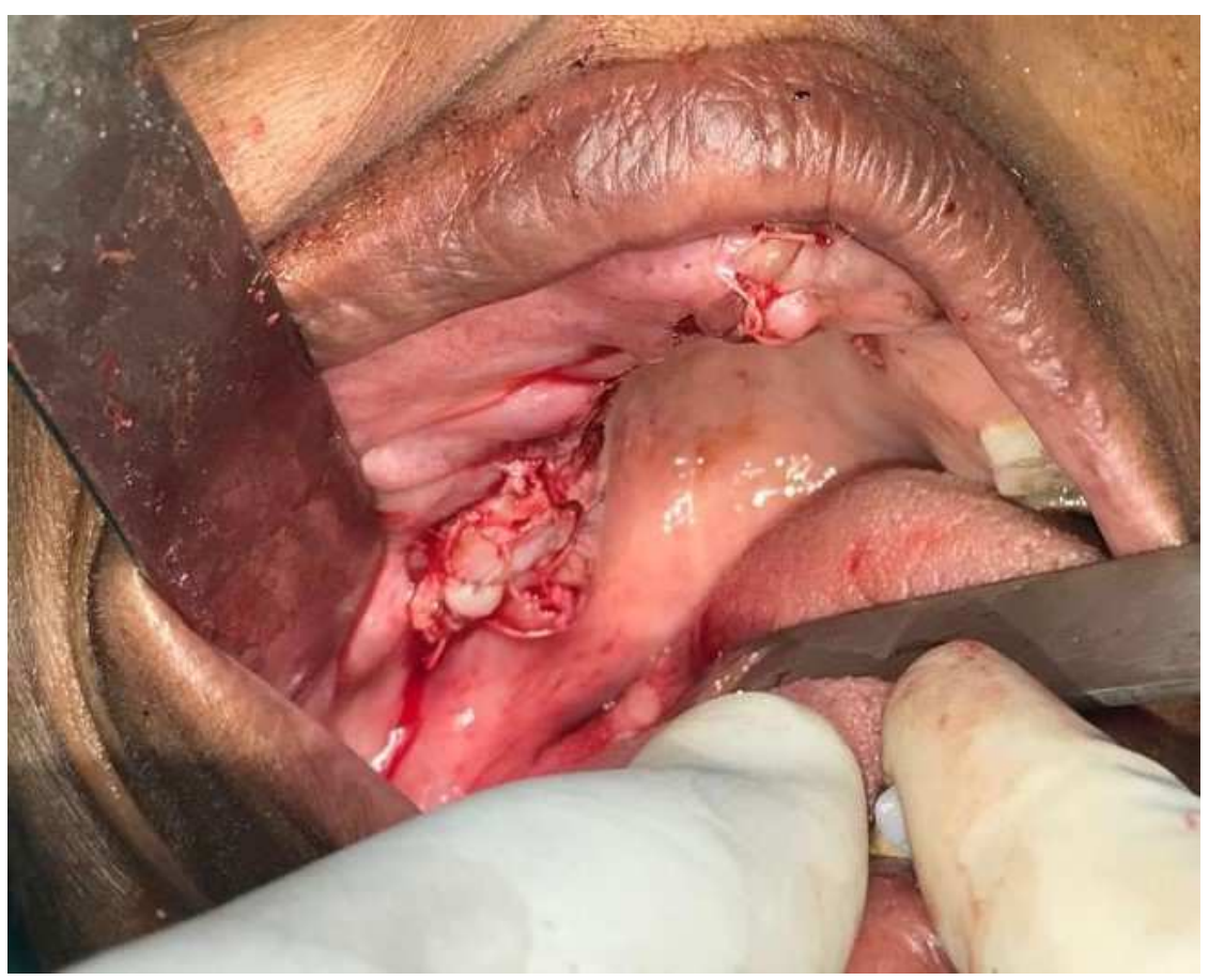
Figure 4: Primary closure achieved.