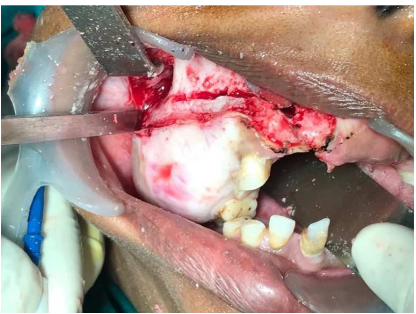
Figure 2: Intraoperative image showing segmental resection done for osteoblastoma.