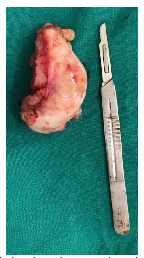
Figure 3: Excised specimen after segmental resection of the tumor.