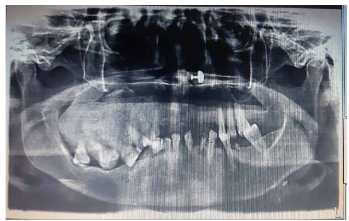
Figure 1: An orthopantomogram showing well defined radiopaque lesion on the right maxilla posterior segment causing extreme deformity of right maxilla and mobility of left maxillary posteriors.