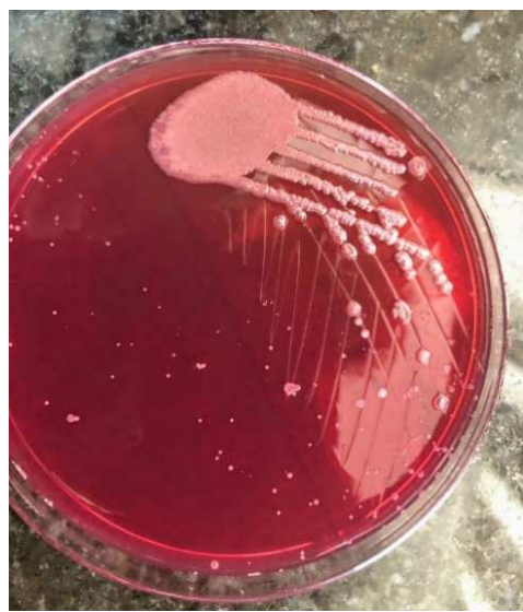
Fig 2: Dry wrinkled colony in MacConkey agar after 48 hours of aerobic incubation at 37 degrees.