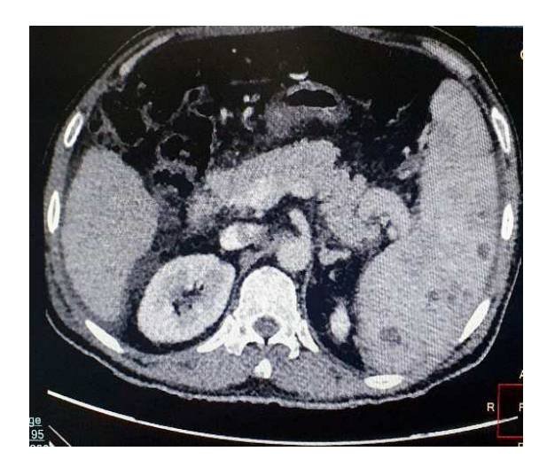
Fig 3: Computed tomography abdomen showed multiple well defined, hypodense regions within the spleen.

Blood culture revealed growth of Burkholderia pseudomallei, sensitive to Ceftazidime. Meropenem, Amoxicillin-Clavulanate, Imipenem, Cotrimoxazole, and Tetracycline and resistant to Gentamicin, Amikacin, Netilmicin, and Colistin. The patient was started on Meropenem and Ceftazidime. He improved symptomatically and was discharged after 10 days and advised to continue on Doxycycline for three months.