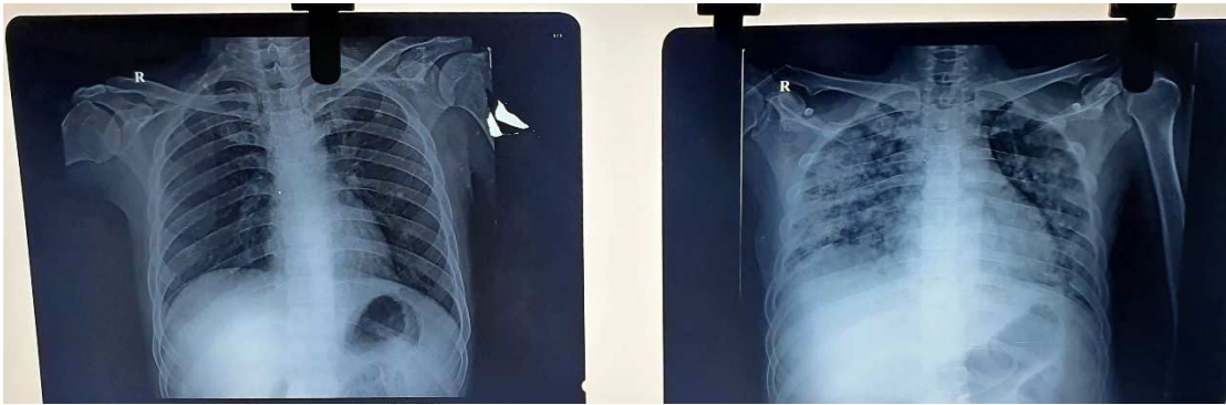
Fig 5: Chest Xray showed bilateral asymmetrical confluent opacities (2<sup>nd</sup> picture) and its resolution after treatment with meropenem (1<sup>st</sup> picture)

had been treated for multilobar pneumonia with intravenous meropenem for 7 days. His chest became clear and was discharged afebrile.