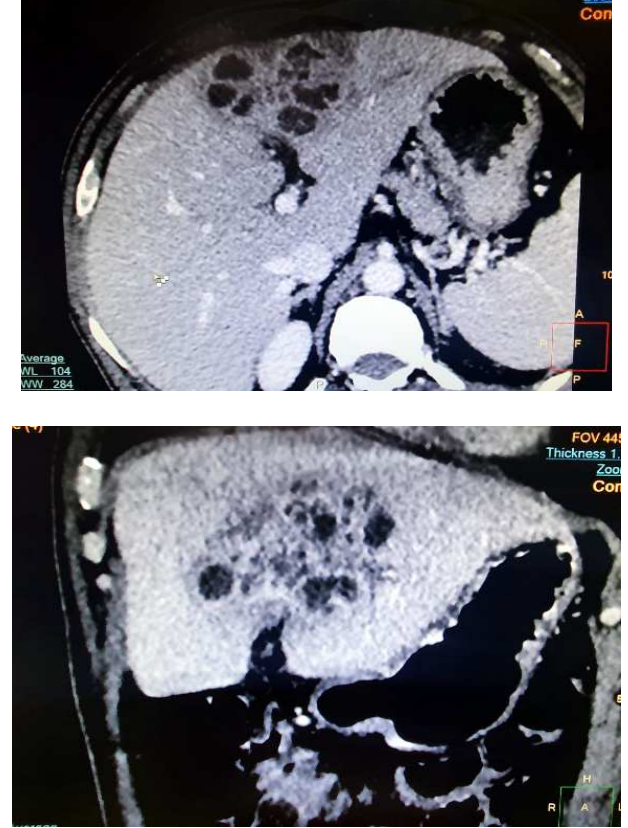
Fig 1: Contrast CT scan of the abdomen showed an ill-defined multiseptated low attenuated mass lesion in the left lobe of the liver with the honeycombing appearance

investigations revealed Laboratory neutrophilic leukocytosis, ESR-67 mm in 1st hr., CRP-121 mg/ld. Urine cultures showed no growth. Test for malaria was negative, sputum for AFB (2 samples) was negative. A contrast CT scan of the abdomen showed an ill-defined multiseptated low attenuated mass lesion in the left lobe of the liver with a honeycombing appearance. Echocardiography revealed no valvular disease, no vegetation, or thrombus. Ultrasonogram (USG) guided fine needle aspiration of the liver mass showed pus and culture revealed growth of Burkholderia sensitive pseudomallei. aztreonam. to ceftazidime, imipenem, and piperacillintazobactum. He was started on piperacillin and ceftazidime. Later he was discharged with advice to take oral co-trimoxazole and doxycycline for 3 months.