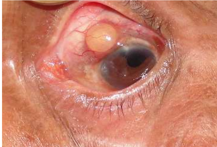
Figure 1: Photograph of the patient showing Subconjunctival dislocation of cataractous lens