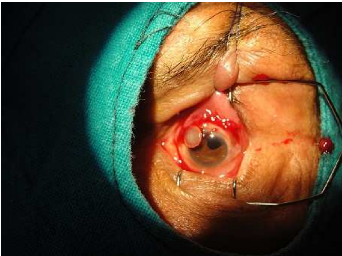
Figure 4: Surgical removal of dislocated lens