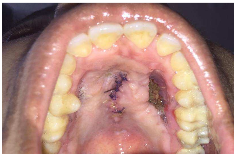
Figure no 1: Clinical photograph of a case of Palatal Myiasis

Oral myiasis is most commonly seen affecting the anterior part of the oral cavity including both jaws and the palate suggesting direct inoculation of tissues(14). The palate is the most commonly involved site. The incidence of extraoral myiasis is higher than that of oral myiasis. This can be attributed to the fact that the tissues of the oral cavity are not always exposed to the external environment(10,15). The gingiva is a rare location for the disease (16).