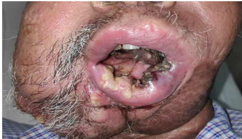
Figure no 5: Clinical photograph of a case of Myiasis in Operated Oral Carcinoma