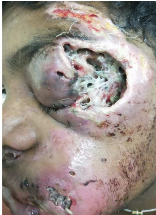
Figure no 7: Clinical photograph of a case of Myiasis of Multiple Orofacial regions