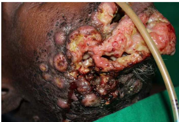
Figure no 3: Clinical photograph of a case of Myiasis in Oral Carcinoma