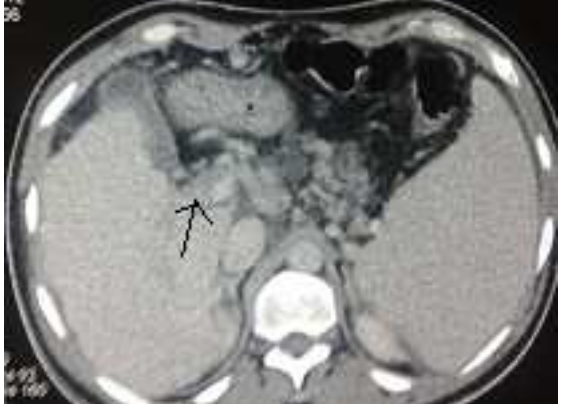
Fig 1. CT portovenogram showing dilated Portal Vein with thrombus in it (arrow)

Vein Portal Thrombosis. Endoscopic variceal ligation was done and other treatment (Aldactone, Lasix, Lactulose and Propranolol) also prescribed for CLD. Following eradication of varices. anticoagulation was started. Oral Vitamin K antagonists were given with overlap of low molecular heparin (LMWH). INR was maintained within a range of 2-3. Meanwhile patient is on waiting list for Liver Transplant. On follow up after 2 months of anticoagulation, his CT portovenogram shows minimal thrombus in Portal Vein with no obstruction to blood flow.