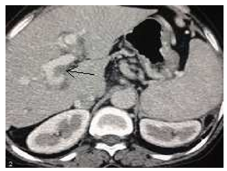
Fig. 3. Thrombus extending into Rt. Portal Vein. (Arrow)

variceal ligation (EVL) was done and patient planned for anticoagulation after eradication of varices. Unfortunately patient developed a massive GI bleed following Post EVL ulcer and succumbed.