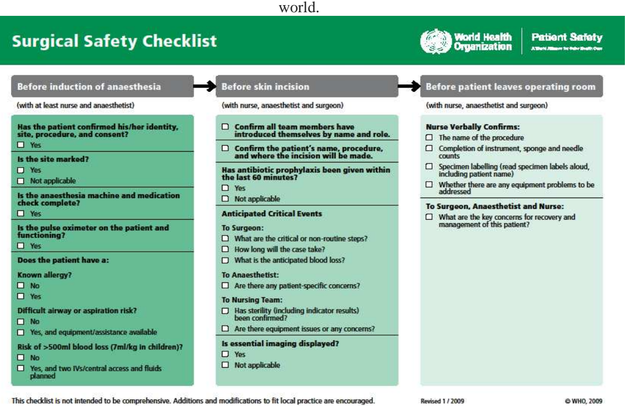
Figure-4 Safety Goals

Safety check lists-Figure3: The WHO Surgical Safety Checklist was developed after extensive consultation aiming to decrease errors and adverse events, and increase teamwork and communication in surgery. The 19-item checklist has gone on to show significant reduction in both morbidity and mortality and is now used by a majority of surgical providers around the