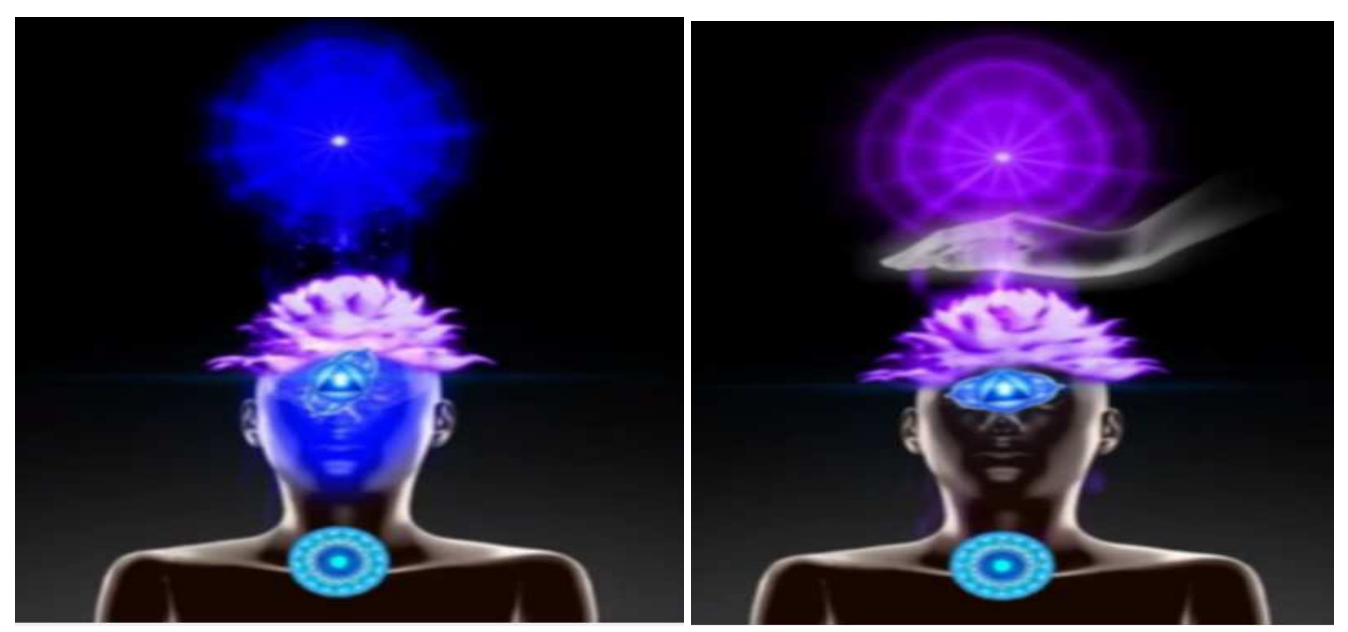
Figure 4: Enlightening and Blissful Neurobics

The children's rights and privacy has been protected throughout the study. The purpose of the study, the research methods, and other precautions have been disclosed to the children's family members only.