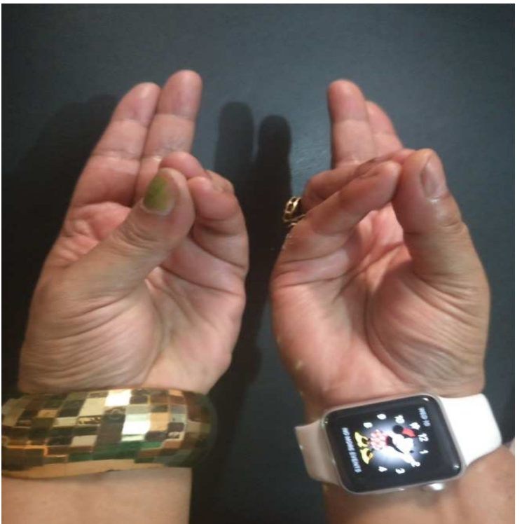
Figure 1: Pran Mudra

Parents have also been requested to show them the video of Neurobic Spa daily in the night before going to sleep. Parents have been demonstrated the methods in details to charge a glass of water with a 3-D Orange stereographic