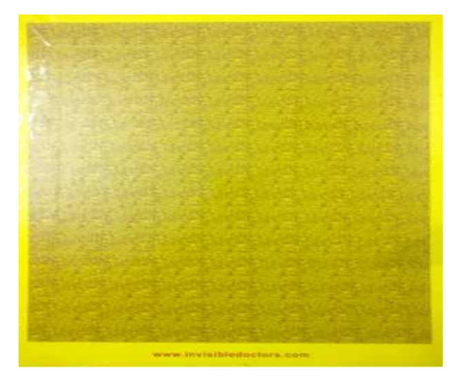
Figure 2: 3D Orange and Yellow Stereographic Plates

In school, I charged their food and water again. Daily, I modeled to all my students to see 3-D Indigo color stereographic plate and to chant the "O" sound with Pran Mudra (Enlightening Neurobics) for 10 minutes in the morning in the classroom and also showed 3-D Violet color stereographic plate and to chant "Humming" sound with Gyan Mudra (Blissful Neurobics) for 10 minutes daily. After lockdown, during