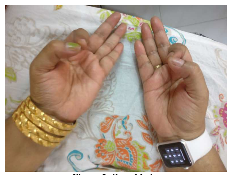
Figure 3 : Gyan Mudra

online classes, I used to charge their food and water through distance charging. I showed 3-D Indigo color stereographic plate using an online platform and to chant "O" sound with Pran Mudra (Enlightening Neurobics) for 10 minutes in the morning and also showed 3-D Violet color stereographic plate and to chant "Humming" sound with Gyan Mudra (Blissful Neurobics) for 10 minutes daily.